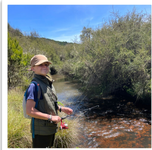
THE NO-FISH FISHING TRIP.