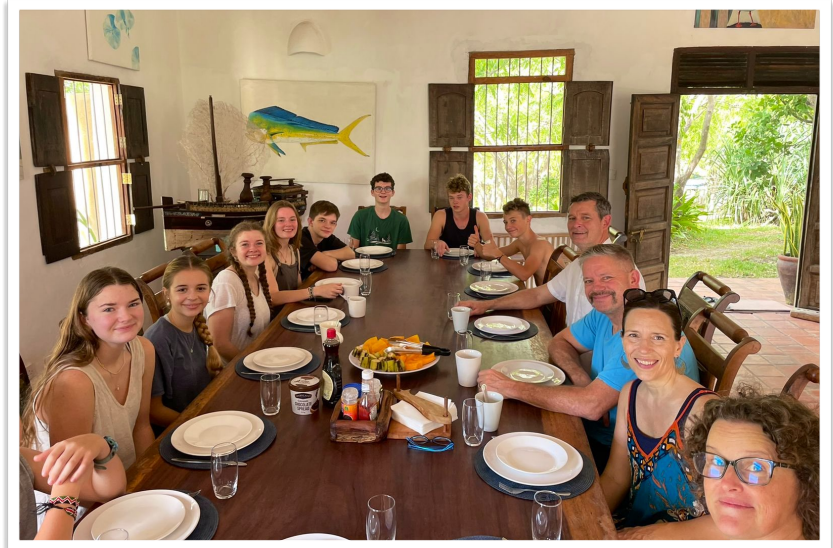
ONE OF MANY MEALS SHARED WITH FAMILY.

As per usual, a lot has been going on so we'll just highlight a few of the major family happenings. Here are the top 5: