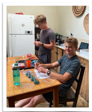
THE "BANE OF OUR EXISTENCE:" AP CHEM. We'll all be happy when this one ends.