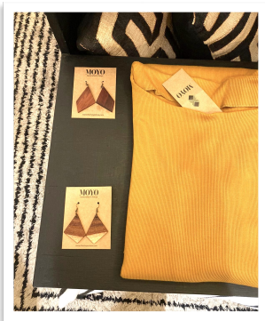
A TINY SAMPLING OF INMAN'S WORK.