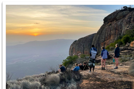
SUNSET ATOP MT. OLOKWE WITH COUSINS. A glorious end after the beginning of a difficult hike!