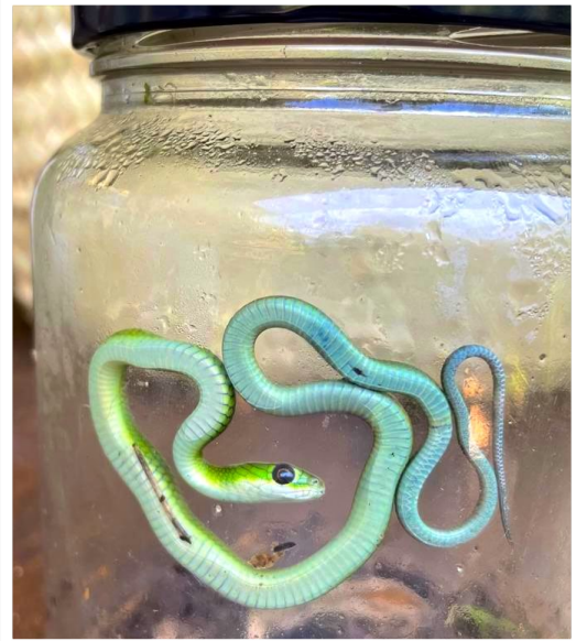
DON'T WORRY: SHE'S NOT VENOMOUS. WE FOUND THIS BATTERSBY'S GREEN SNAKE IN THE YARD. WE OBSERVED HER FOR AWHILE BEFORE RELEASING HER BACK INTO HER NATURAL HABITAT. SHE DID NOT LIKE HER CLOSED QUARTERS ONE BIT!

This image captured my attention as I gathered photos for this quarter's update: the way this snake has completely pressed its whole body up against the glass jar, looking out intently with her giant eye. It's as if every part of her is trying hard to get back to her natural habitat. Is she pressing out in hope? desperation? longing? .