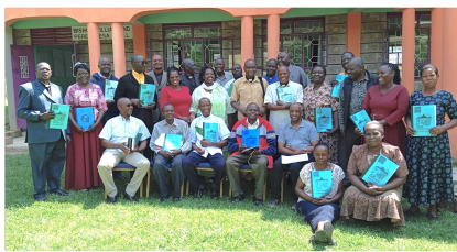
KENYAN ANGLICAN PASTORS & LEADERS RECEIVING TRAINING IN MODULE 8 OF 10.