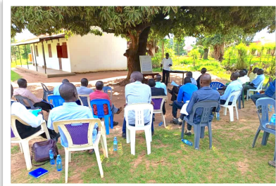
OUTDOOR CLASSROOM IN UGANDA.